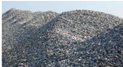
Fig.1 Coarse Aggregate

Coarse-grained mixtures won't tolerate a sieve with 4seventy five metric linear unit openings..Those particles that are preponderantly preserved on the 4.75 mm sieve and can pass through 3-inch screen, are referred to as coarse aggregate. The coarser the aggregate, the additional economical the mix. Larger items provide less area of the particles than identical volume of tiny pieces. Use of the biggest permissible maximum size of coarse aggregate permits a discount in cement and water requirements. exploitation aggregates larger than the utmost size of coarse aggregates permissible may end up in interlock and type arches or obstructions inside a concrete form. that enables the world below to become a void, or at best, to become crammed with finer particles of sand and cement solely and results during a weakened area. they're shown in fig.1 For Coarse Aggregates in Roads following properties are desirable Strength