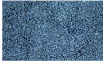
Fig .2 Fine Aggregate

The other sort of mixtures are those particles passing the 9.5 metric linear unit (3/8 in.) sieve, nearly entirely passing the 4.75 mm (No. 4) sieve, associate degreeed preponderantly preserved on the seventy five \mu\text{m} (No. 200) sieve are known as fine aggregate. For enlarged workability and for economy as mirrored by use of less cement, the fine aggregate ought to have a rounded shape. the aim of the fine aggregate is to fill the voids within the coarse aggregate and to act as a workability agent In concrete, an mixture is hired for its economic system factor, to reduce any cracks and most importantly to deliver energy to the structure. they're shown in fig.2