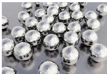
Fig 5 : Silver Nanoparticles

The researchers located that silver nanoparticles had a damaging end result on cells, suppressing cell increase and multiplication and causing necrobiosis relying on concentrations and duration of exposure. In particular, the two hundred nm silver debris brought on a concentration-structured boom in DNA harm within side the human cells.