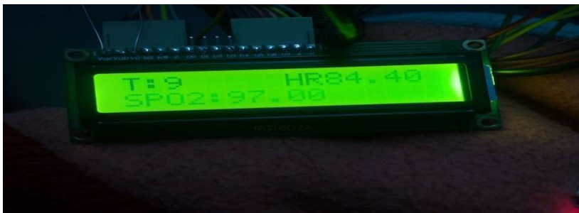
Picture1.Display of data

The final result of the system is we get a person's heart rate, body temperature and oxygen level on the display. A sixteen by two display is used to show the data, on that digital reading are displayed so anyone can easily detect and read the parameters. By checking the readings of parameters one can detect patients health But, if the readings are not in normal range then a person can immediately visit to the doctor. As shown in picture 1 three parameters are displayed where T is temperature, HR is heart rate and SPO2 is the oxygen level.